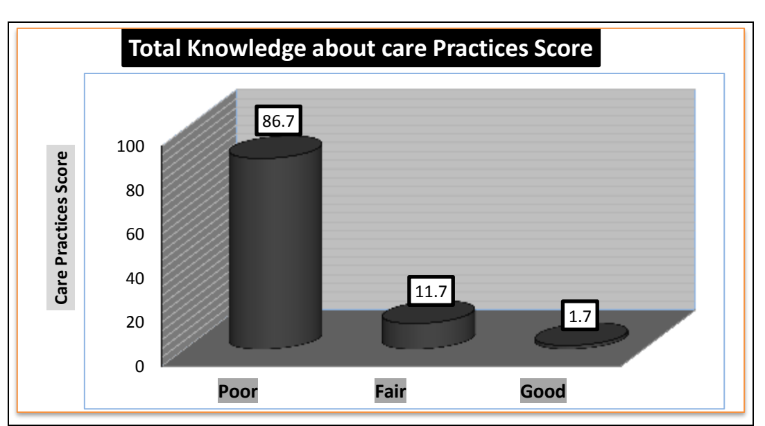
Fig (2): Total Knowledge about care Practices Score